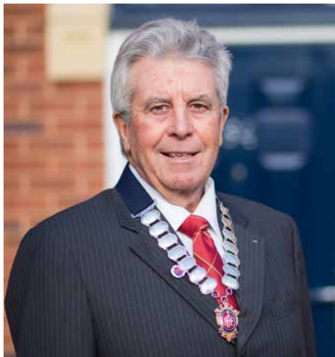
International President – 2016-17

It has been an honour and a pleasure to serve you as International President and I thank you for the confidence you have shown me during my term.