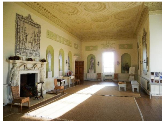
Long Gallery, Croome Court

share your knowledge and experience. You get a real buzz when you get accepted because you feel like you have achieved something and are recognised for your efforts. If you are not on a register then who is monitoring or reviewing what you do and how you do it? When providing advice on fire life safety then you know what the consequences could be for getting it wrong.